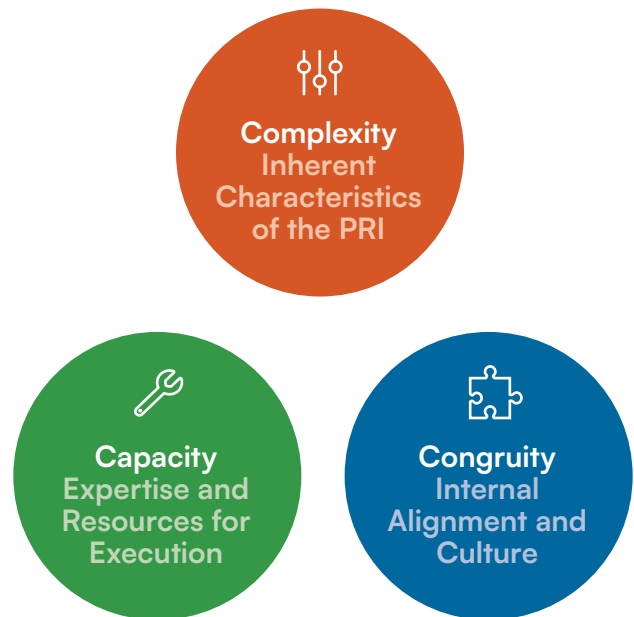
Figure 1 • Three Factors Shaping Foundation PRI Experience

"I think we made the deal more complicated than we needed to. The prospect of generating a return triggered a higher level of scrutiny and caution internally, so we had all these conditions on the deal."